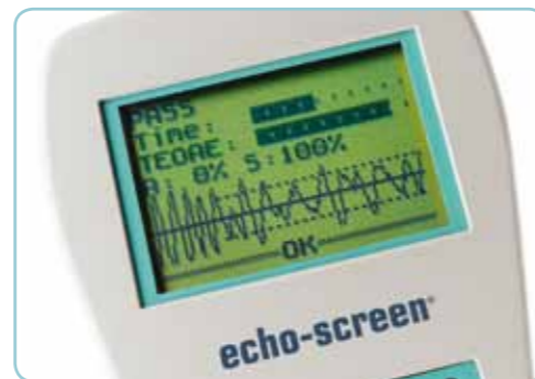
Automated TEOAE PASS Result