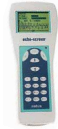
Echo-Screen Plus (17-key) configuration